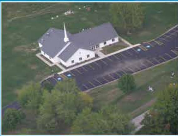
South Harpersfield United Methodist Church Geneva, Ohio